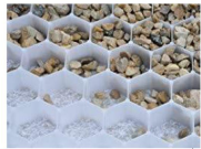
Gravel Stabilisation Grid