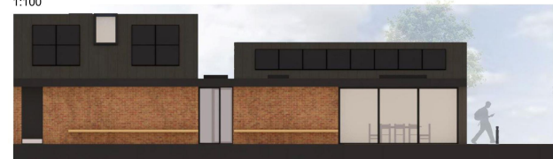
Proposed South Elevation 1:100