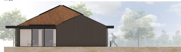
Proposed East Elevation 1:100