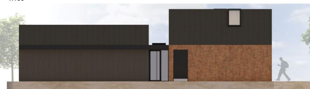
Proposed North Elevation 1:100