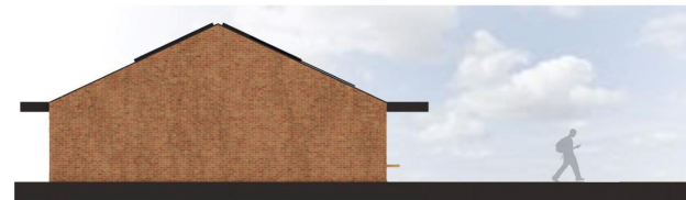
Proposed West Elevation 1:100