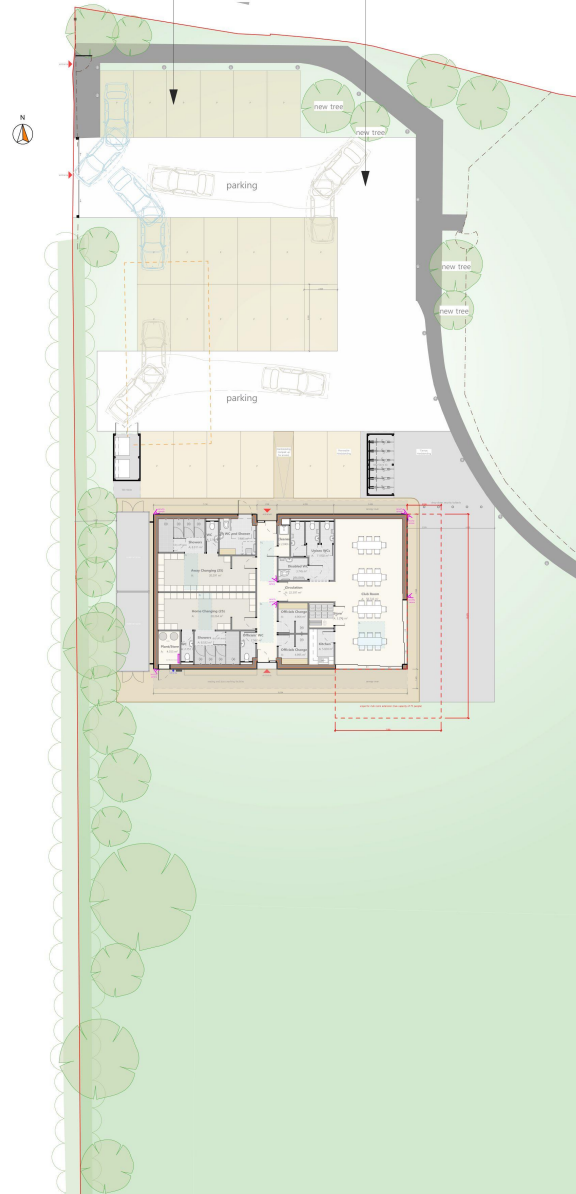
Proposed Site Plan 1:200