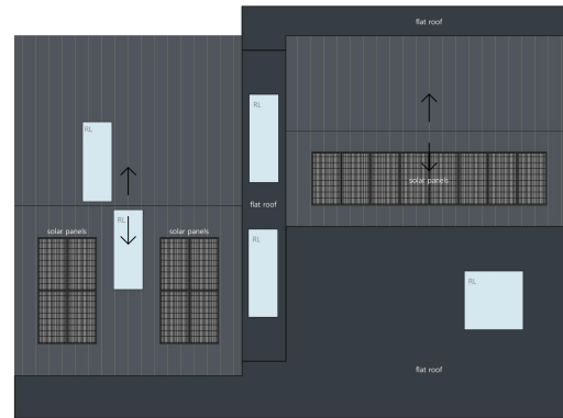
Proposed Roof Plan 1:100