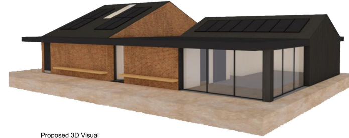
Proposed 3D Visual