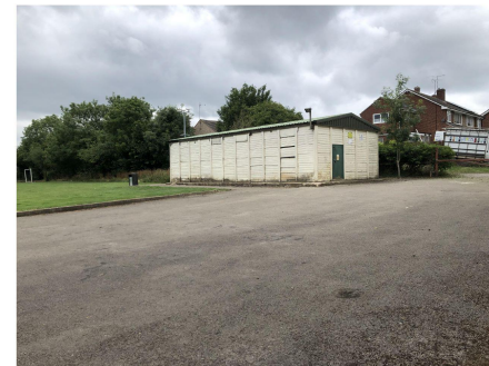
Existing View from North East