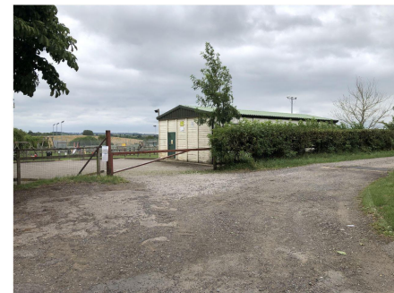
Existing View from Chapel Street