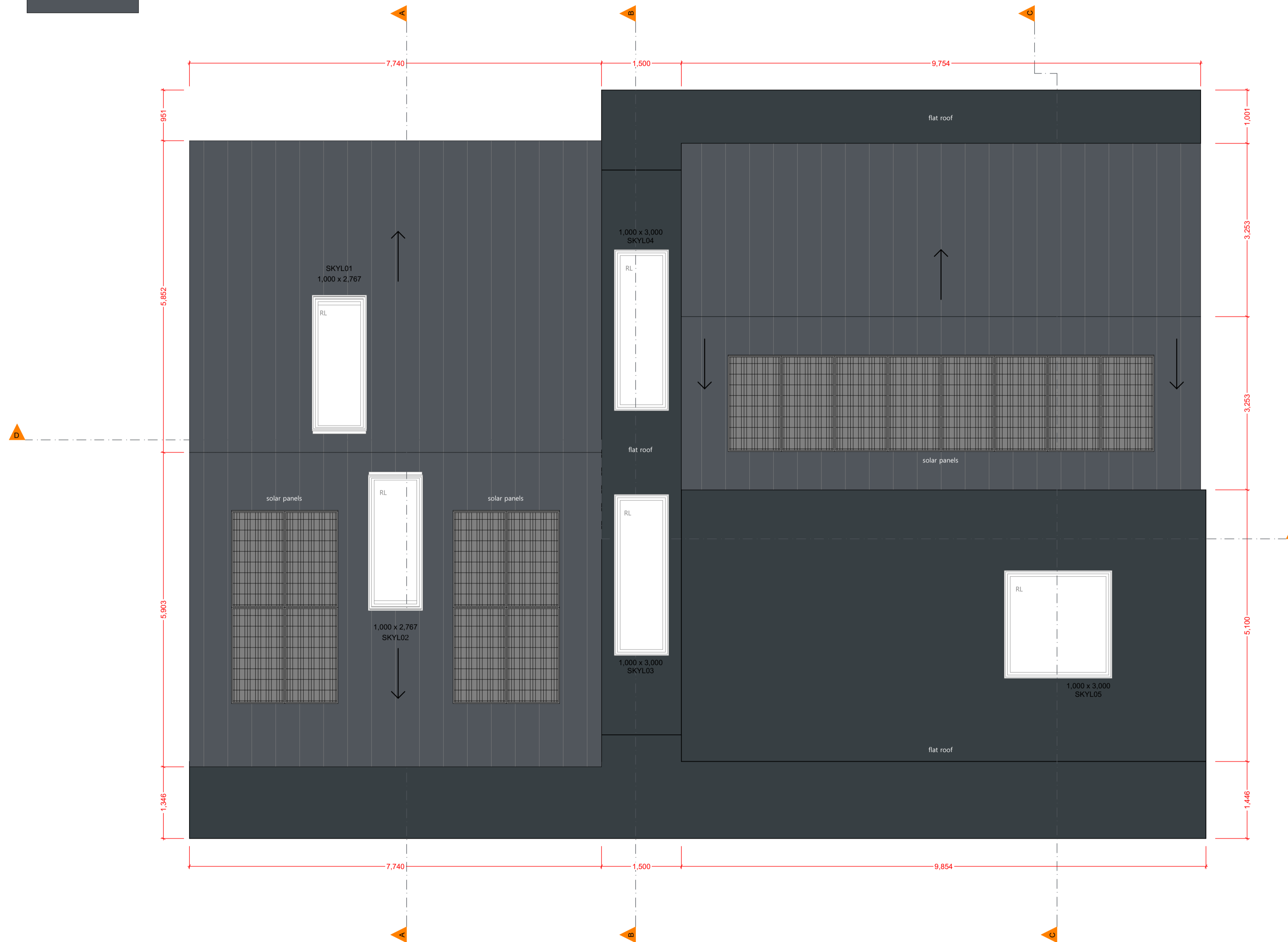
Proposed Roof Plan 1:50