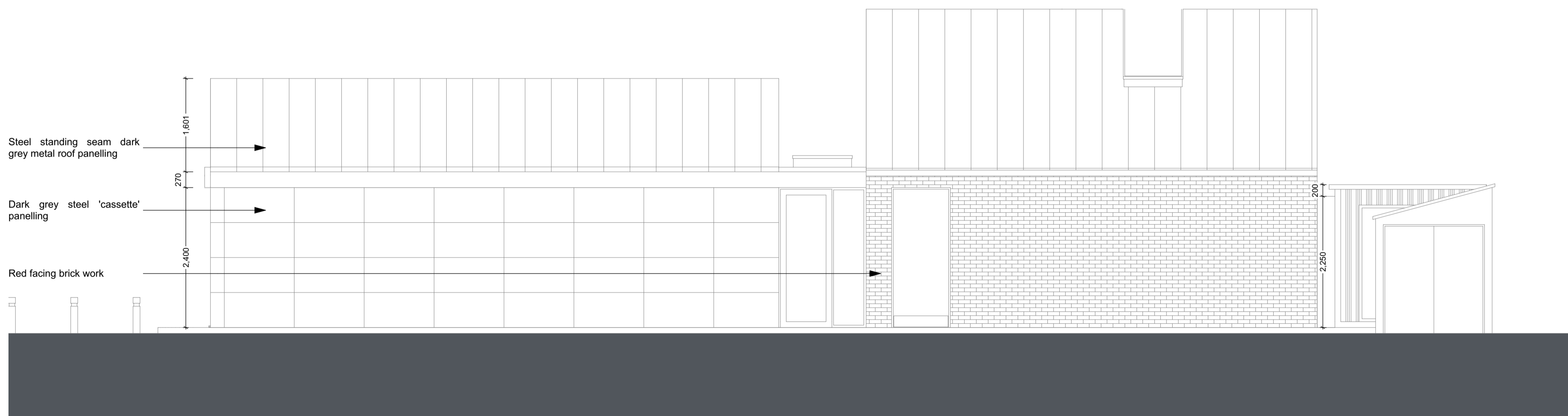
Proposed North Elevation 1:50